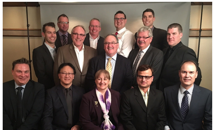
This photo was taken at the 2017 Tri-Party Transportation Conference in Red Deer, Alberta.