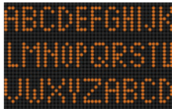
3x7 font (up to 11 characters)