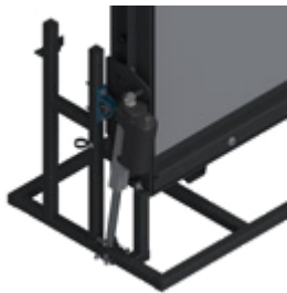
VMS-A59 Power tilt support (optional)