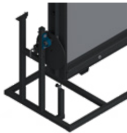
VMS-A65 Manual support (standard)