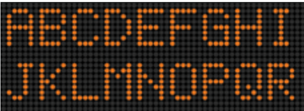
5x7 font (up to 9 characters)