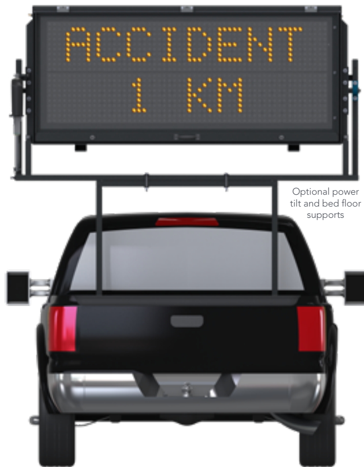
Optional power tilt and bed floor supports

Ver-Mac's TM-2056 is a full-matrix truck-mounted message sign that is powered from the truck's battery. The TM-2056 offers some graphic capability such as one touch arrow, directional display and sequencing functions. The TM-2056 allows 2 lines of text and 9 characters per line. The TM-2056 features the innovative V-Touch controller that plugs into the cigarette lighter. The TM-2056 is ideal for highway construction and maintenance crews, highway stripping trucks, highway emergency and helper trucks.