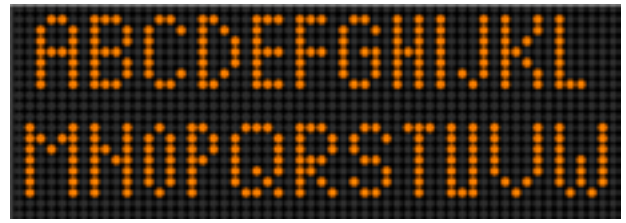
3x7 font (up to 12 characters)